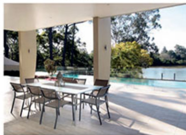
OPEN MINDED ... natural light and river views add to the house's appeal.

beneath a 5.5m-wide window with six panes of glass weighing 120kg each. Such a structural arrangement called for some ingenious engineering as the architect had never worked with the doors before.